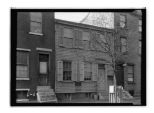
Figure 1: Walt Whitman House, 328 Mickle Street, Camden, Camden County, NJ Historic American Buildings Survey. Nathaniel R. Ewan, Photographer April 15, 1936/ Library of Congress

Notwithstanding the state of the room, Osler found that Whitman at the age of 65 was "a fine figure of a man who had aged beautifully, more properly speaking, majestically." He described his large frame and well-poised head with kindly, gentle eyes and which was covered with snow-white hair, beard and moustache. Osler did not get much information from Whitman about his health at that visit. But at a second visit a few days later, Osler learned of the 1873 stroke and left-sided paralysis. He noted that Whitman had recovered use of his arm and hand but that his leg remained a little weak. Osler remarked that after careful examination he was able to tell Whitman that "the machine was in fairly good condition considering the length of time it had been on the road." 11