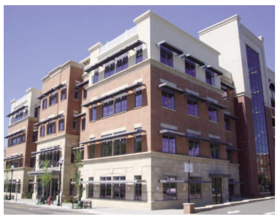
The 14 Maple Avenue project was awarded not only the 2007 NJ Future Award as part of the overall Epstein's redevelopment project, but also the 2009 New Jersey Smart Growth Award.

efficiently; and reduces the overall impact on the environment. The practice of green building also incorporates the use of recycled building materials which reduces the amount of waste sent to landfills; a reduction in the amount of waste sent to landfills results in a reduction in the amount of released methane (a harmful gas) which is caused by landfill decomposition. The environmental benefits of green building are obviously significant but there are other reasons to go green which should not be overlooked.