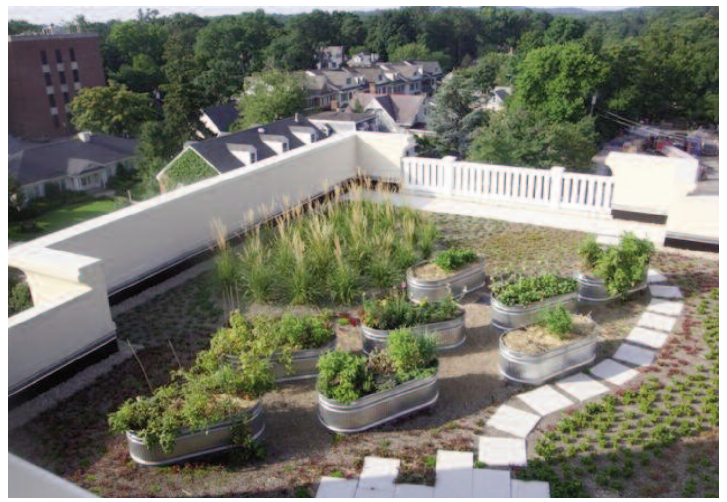
A vegetative roof reduces solar heat gain and improves water quality flowing from the roof of a green office/parking garage in Morristown.

The EPA has described a green building, also known as a sustainable building, as "a structure that is designed, built, renovated, operated, or reused in an ecological and resource-efficient manner." According to EPA a green building protects occupant health; improves employee productivity; uses energy, water and other resources more